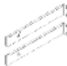
Two brackets included in each kit